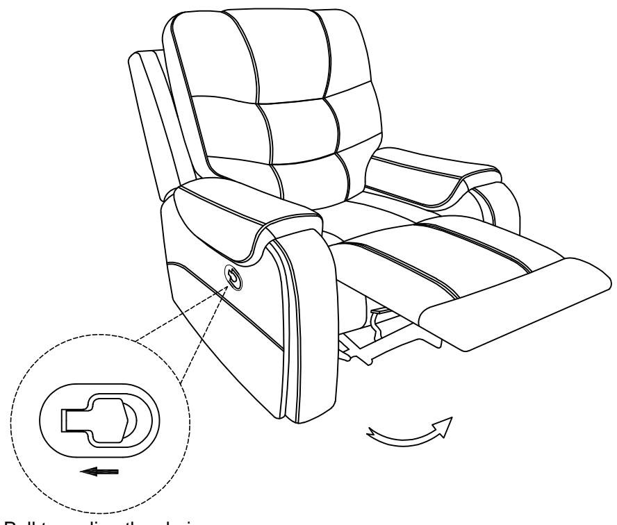
Pull to recline the chair